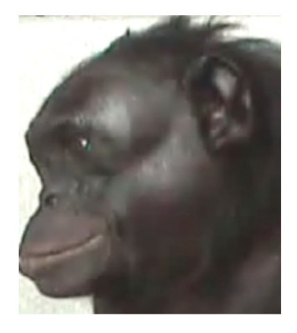
Figure 2. The bonobo Kanzi (Pan paniscus) profile.