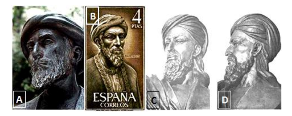
Figure 11. Maimonides statue (A), erected in 1964 in Tiberiadus Square, Juderia (Jewish old quarter), Cordoba and depicted on a Spanish stamp issued 1967 (B). The Ibn Sina (Avicenna, c. 980–1037)) statue (C,D) (<a href="http://www.muslimphilosophy.com">http://www.muslimphilosophy.com</a>) may have served as inspiration.

Key figures engaged in circulating the Maimonides portrait in Europe in the eighteenth and nineteenth centuries were mostly leaders of the Jewish Enlightenment movement ( Haskalah in Hebrew). Haskalah advocated adopting enlightenment values, pressing for better integration into European society, and increasing education in secular studies, Hebrew language, and Jewish history. Haskalah in this sense marked the beginning of the wider engagement of European Jews with