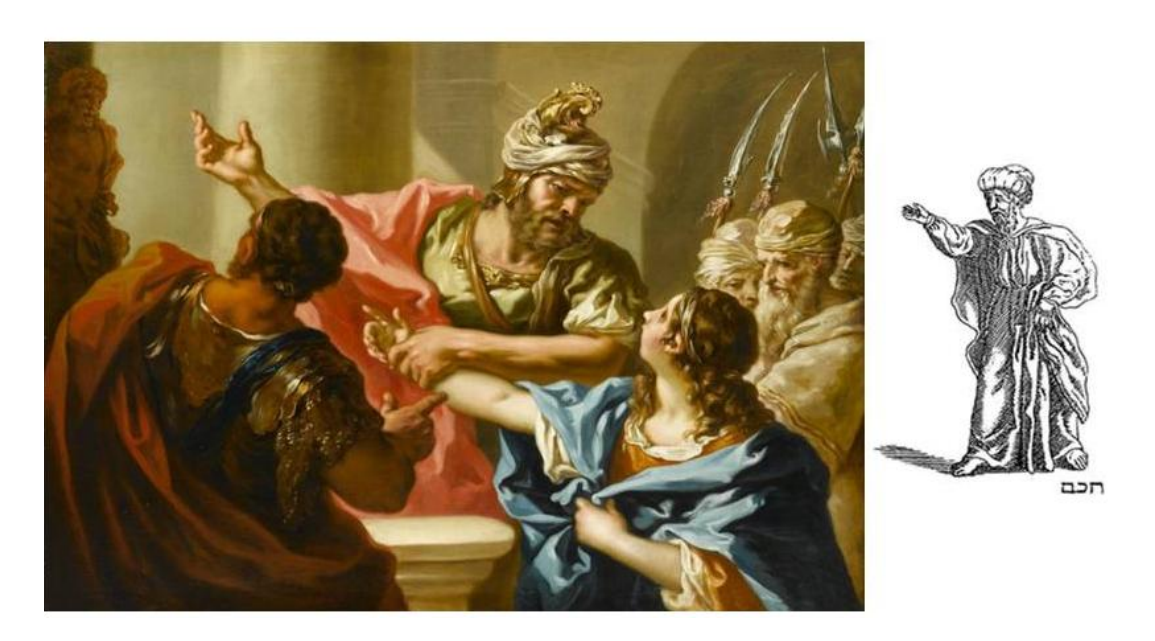
Figure 10. Giovanni Pellegrini (1675–1741): "Young Hannibal Swears Enmity to Rome", 1731. There is an exceptional intentional resemblance between Hannibal and the Wise Son (or Scholar) of the Amsterdam Haggada (right).

Whoever drew the Maimonides portrait used skillfully the same successful principles of iconographic illustrations incorporating all Maimonides' characteristics that would have been expected by the target readers.