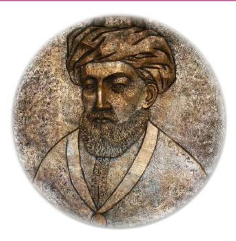
Figure 12. Plaque of Maimonides at the main entrance hall, Rambam Medical Center, Haifa, Israel.

Interestingly, ever since the beginning of the seventeenth century the Sephardic Chief Rabbi, the Rishon LeZion ("First to Zion" in Hebrew), wears gold-braided robe and turban. The outfit is partially reminiscent of the Hakham Bashi who used to represent the Jews in front of the Turkish Ottoman authorities, but in its current format it is majorly in the wake of Maimonides.