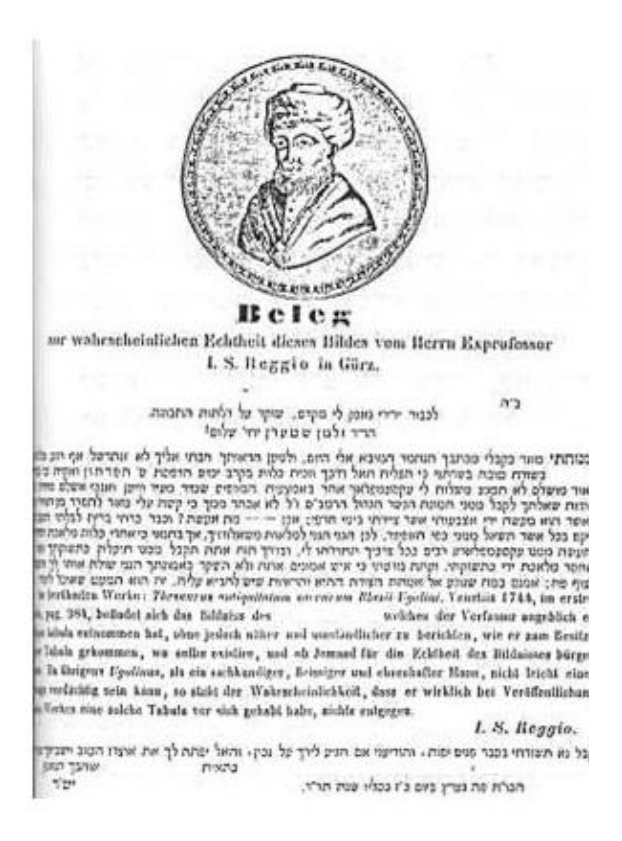
Figure 4. Reggio's letter to Solomon Stern, December 20, 1843. Note the main text in this correspondence was written in Hebrew whereas when addressing the delicate issue of the portrait's authenticity Reggio reverted to German.

Herr Solomon Stern printed on one sheet of paper a few copies of the above miniature, accompanied by a copy of Reggio's letter (Figure 4). I was fortunate enough to get a copy of that document, sent to me by a kind friend from Berlin, who knows my partiality for such literary curiosities.