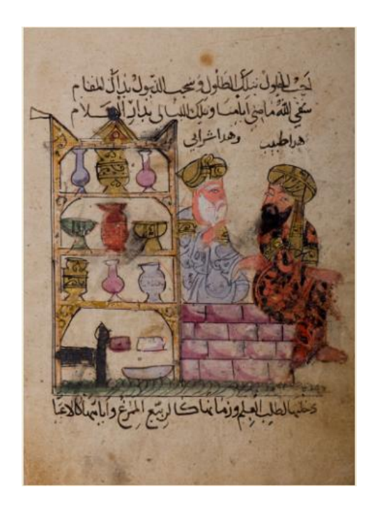
Figure 8. Detail from a miniature from Ibn Butlan's Risalat da'wat al-atibba .

In 1669, and again in 1728, two similar portraits of Sabethai Zvi (1626–1676), the Jewish