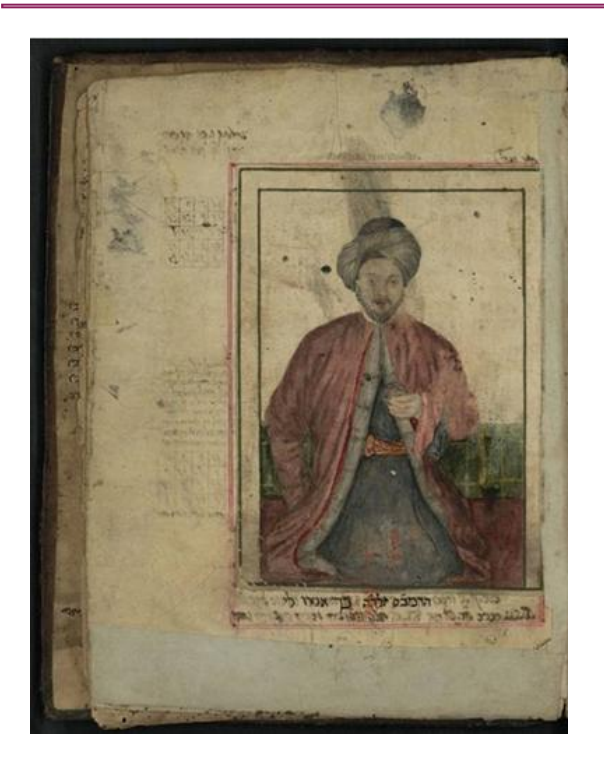
Figure 5. Maimonides portrait.<sup>7</sup> Maimonides appears to be holding Nautilus as a symbol of his broad knowledge of natural sciences.

and apparently played an active role in its dissemination. The portrait was not limited to paper and reprints but was also copied on medallions