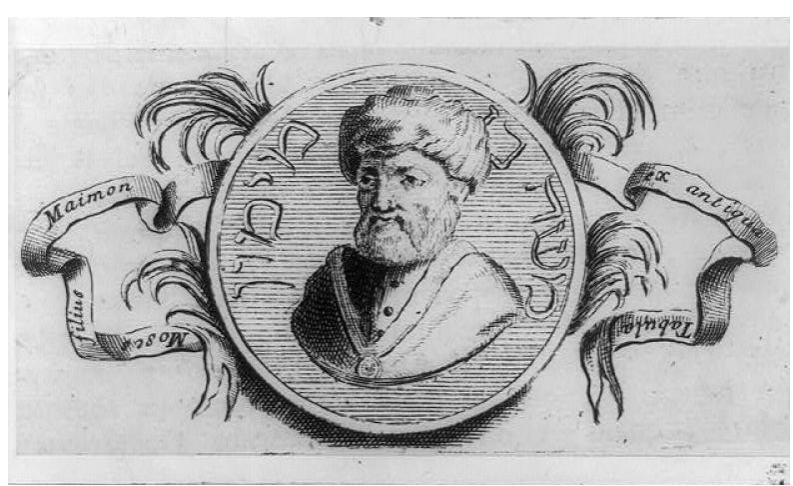
Figure 3. The Maimonides portrait in Thesaurus Antiquitatum Sacrarum. <sup>4</sup>

parts of the Mishneh Torah, considered Maimonides' magnum opus.