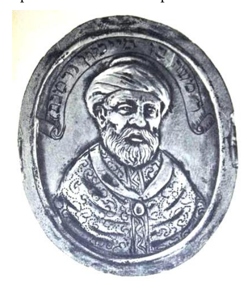
Figure 6. Maimonides bronze medallion from the Renaissance (no exact dating).<sup>8</sup>

and apparently played an active role in its dissemination. The portrait was not limited to paper and reprints but was also copied on medallions