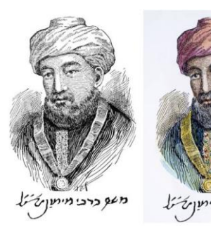
Figure 1. Maimonides' traditional portrait and autograph.¹ This nineteenth-century imaginative depiction, courtesy of the Granger Collection, NY, is possibly by the American illustrator Arthur Burdett

Of the numerous available versions of this portrait let us focus on the pen-and-ink drawing frequently cited and known as "portrait and autograph" (Figure 1). The depicted Maimonides sig-