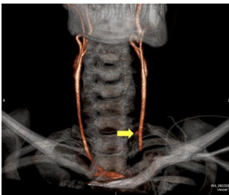
Figure 2. Three-dimensional reconstruction with pseudoaneurysm (arrow) of the common carotid after a stab wound to the neck.

structures, allowing more accurate operative planning (Figure 2).