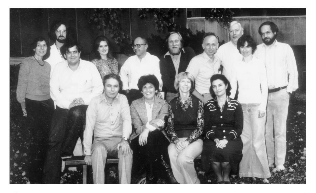
Figure 3. The research team at the Fox Chase Cancer Center, Philadelphia, 1979.