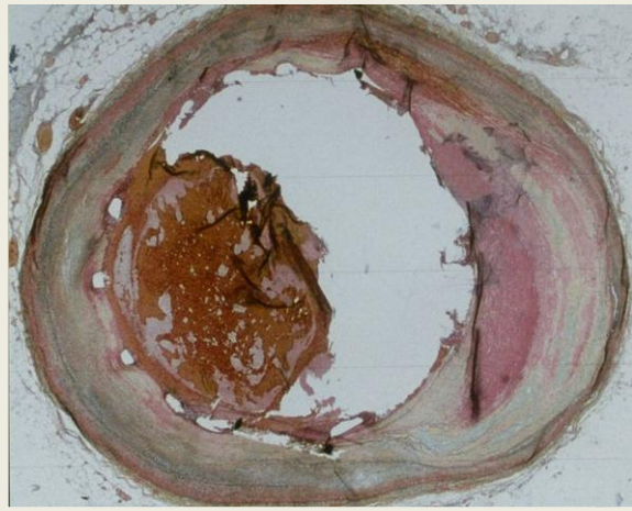
Figure 1. Stent thrombosis.