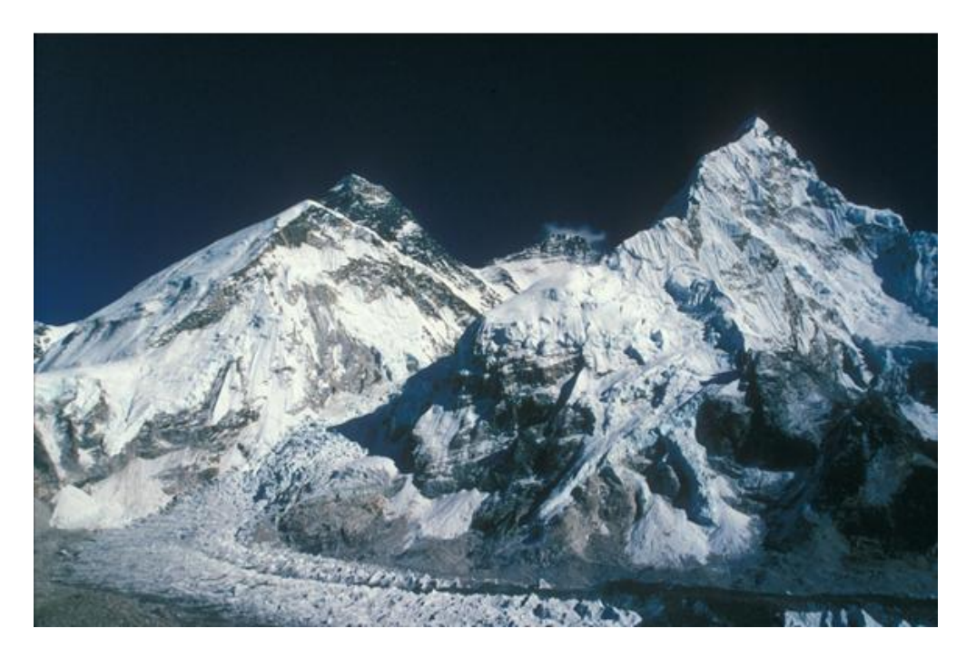
Figure 1. Nuptse on the right, Lhotse in the center, and Mount Everest to the left rear with the Khumbu ice-fall and glacier in the foreground.

physiologic responses to high-altitude hypoxia to provide a context for understanding high-altitude illnesses; the second is to discuss specific risk factors, prevention, and treatment options for acute mountain sickness (AMS) and the potentially fatal syndromes of high altitude pulmonary and cerebral edema so that physicians and health care professionals can appropriately advise travelers ascending to high altitude. The review is organized by specific topics to allow the reader to quickly identify areas of interest.