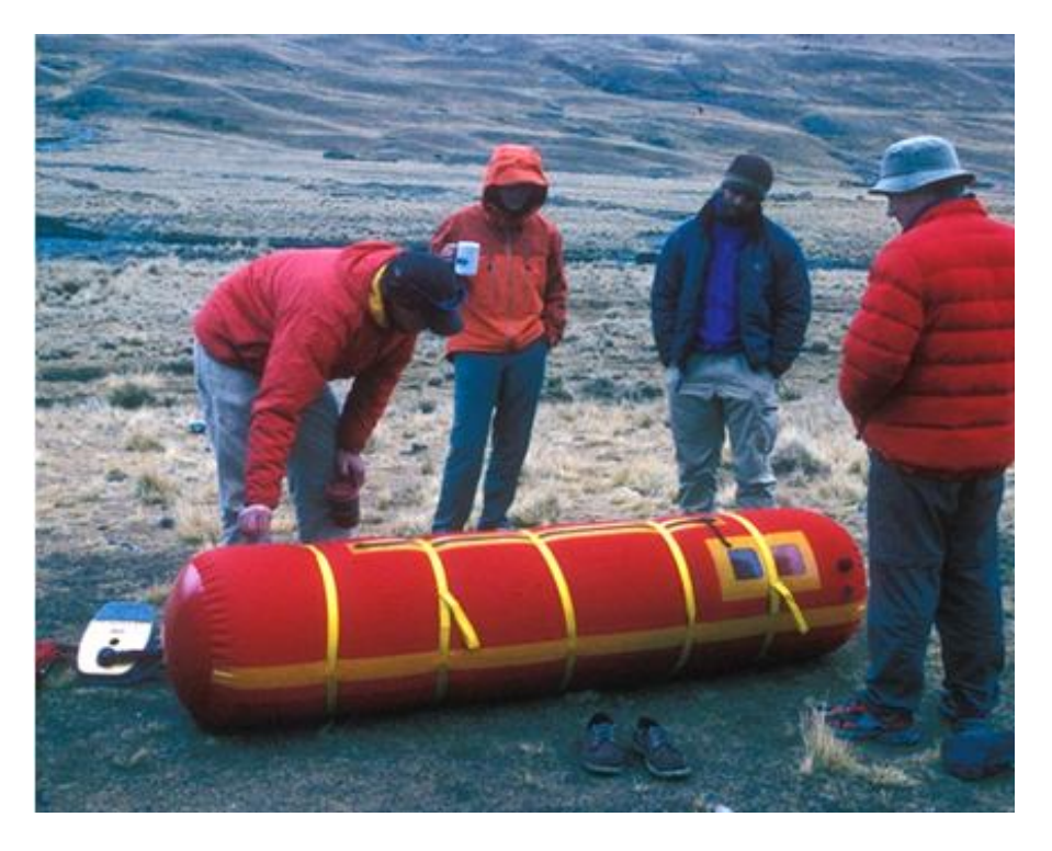
Figure 4. Portable hyperbaric chamber.

The exact processes leading to high-altitude cerebral edema are unknown although the edema is probably extracellular, due to blood-brain barrier leakage (vasogenic edema), rather than intracellular, due to cellular swelling (cytotoxic