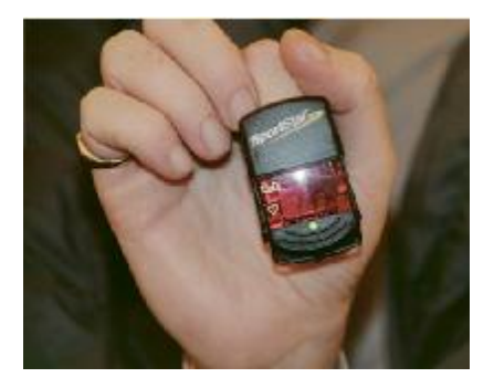
Figure 3. Pulse oximeter.

Pulse oximeters have a pair of small diodes