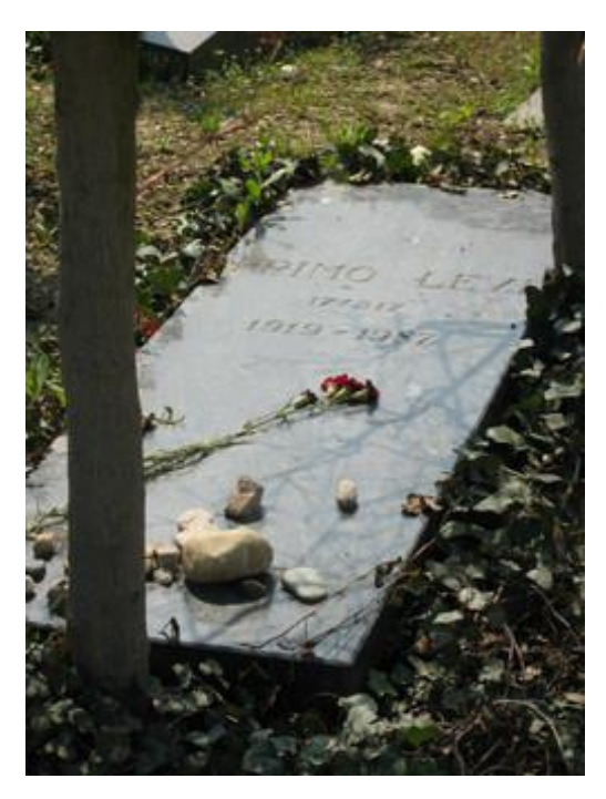
Figure 2. Grave of Primo Levy.