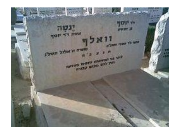
Figure 3. Grave of Joseph Wulf.

The example of persecuted Jewish writers serves as an extension of the above-mentioned social thesis of suicide. The biographical data on Jewish writers who committed suicide reveal that all were perse-