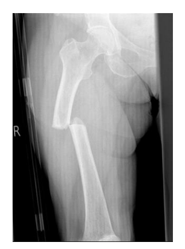
Figure 4. Atypical Femoral Fracture of the Right Femur.

Atypical femoral fractures (Figure 4) are rare, but the evidence when taken as a whole does suggest that their incidence is significantly increased in patients treated with BP therapy. The relative risk may be high, but the absolute risk is low. For the vast majority of patients the reduction in risk of osteoporotic fracture with treatment vastly outweighs the risks of rare side effects such as AFFs. However, BP therapy should be regularly reviewed, particularly after 5 years, and only continued in those patients deemed to be at high risk. Patients who complain of thigh or groin pain must be investigated for potential incomplete fractures and managed appropriately, in particular having their anti-resorptive therapy stopped. Health professionals need to be aware of risks, but it is important that