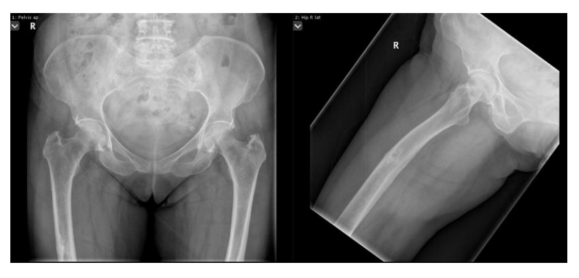
Figure 1. Radiograph Showing Incomplete Atypical Femoral Fracture of the Right Femur with Lateral Cortical Thickening.