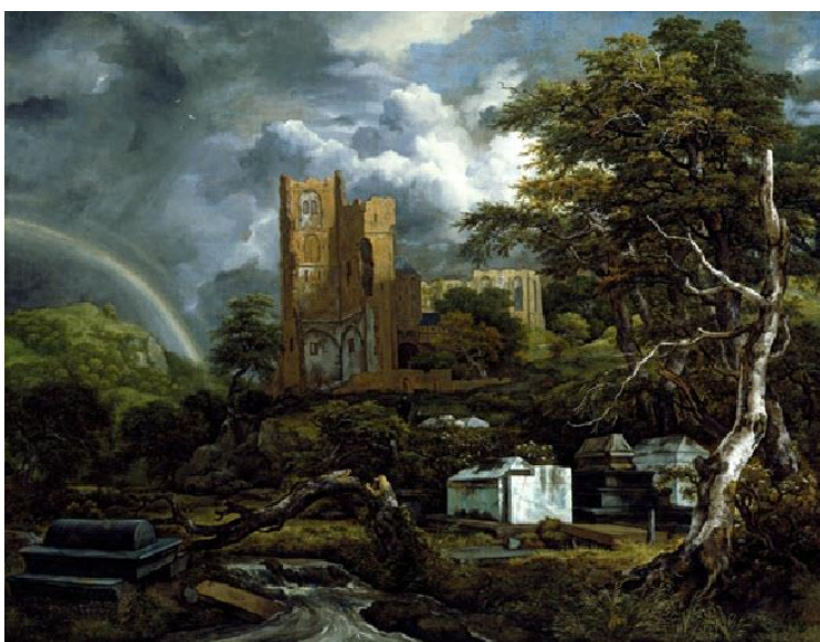
Figure 2. Jacob Isaaksz van Ruisdael, The Jewish Cemetery , 1654 or 1655, Oil on Canvas. Detroit Institute of Arts, 26.3.