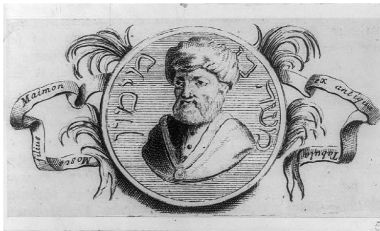
Figure 3. The Maimonides portrait in Thesaurus Antiquitatum Sacrarum . 4

parts of the Mishneh Torah, considered Maimonides' magnum opus.