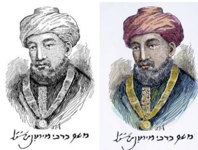
Figure 1. Maimonides' traditional portrait and autograph. 1 This nineteenth-century imaginative depiction, courtesy of the Granger Collection, NY, is possibly by the American illustrator Arthur Burdett Frost.

Of the numerous available versions of this portrait let us focus on the pen-and-ink drawing frequently cited and known as “portrait and autograph” (Figure 1). 1 The depicted Maimonides sig-