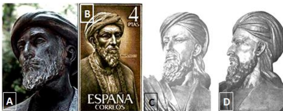
Figure 11. Maimonides statue (A), erected in 1964 in Tiberiadus Square, Juderia (Jewish old quarter), Cordoba and depicted on a Spanish stamp issued 1967 (B). The Ibn Sina (Avicenna, c. 980–1037) statue (C,D) ( http://www.muslimphilosophy.com ) may have served as inspiration.

Key figures engaged in circulating the Maimonides portrait in Europe in the eighteenth and nineteenth centuries were mostly leaders of the Jewish Enlightenment movement ( Haskalah in Hebrew). Haskalah advocated adopting enlightenment values, pressing for better integration into European society, and increasing education in secular studies, Hebrew language, and Jewish history. Haskalah in this sense marked the beginning of the wider engagement of European Jews with