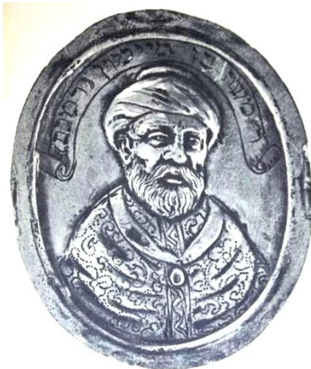
Figure 6. Maimonides bronze medallion from the Renaissance (no exact dating). 8

and apparently played an active role in its dissemination. The portrait was not limited to paper and reprints but was also copied on medallions