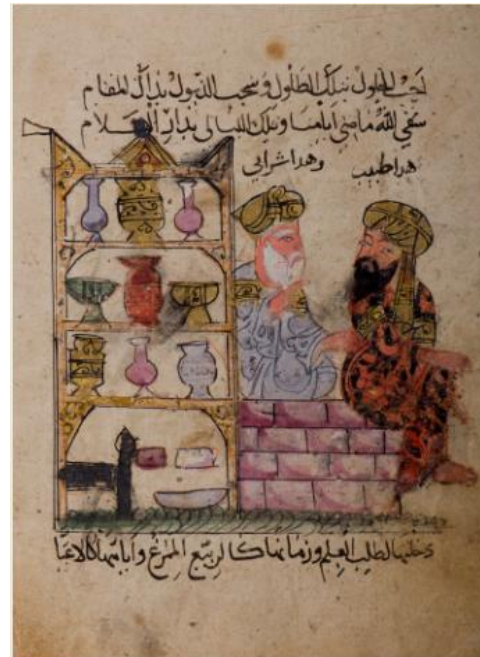
Figure 8. Detail from a miniature from Ibn Butlan’s Risalat da’wat al-atibba .

In 1669, and again in 1728, two similar portraits of Sabethai Zvi (1626–1676), the Jewish