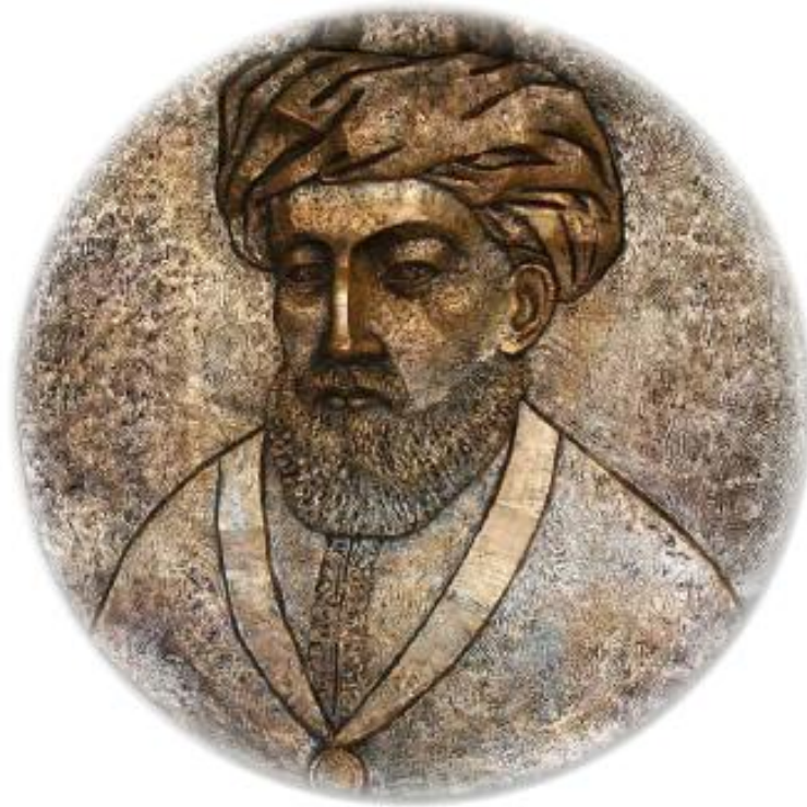
Figure 12. Plaque of Maimonides at the main entrance hall, Rambam Medical Center, Haifa, Israel.

Interestingly, ever since the beginning of the seventeenth century the Sephardic Chief Rabbi, the Rishon LeZion (“First to Zion” in Hebrew), wears gold-braided robe and turban. The outfit is partially reminiscent of the Hakham Bashi who used to represent the Jews in front of the Turkish Ottoman authorities, but in its current format it is majorly in the wake of Maimonides.