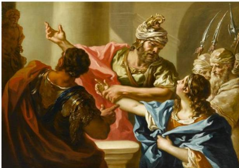
Figure 10. Giovanni Pellegrini (1675–1741): “Young Hannibal Swears Enmity to Rome”, 1731. There is an exceptional intentional resemblance between Hannibal and the Wise Son (or Scholar) of the Amsterdam Haggada (right).

Whoever drew the Maimonides portrait used skillfully the same successful principles of iconographic illustrations incorporating all Maimonides’ characteristics that would have been expected by the target readers.