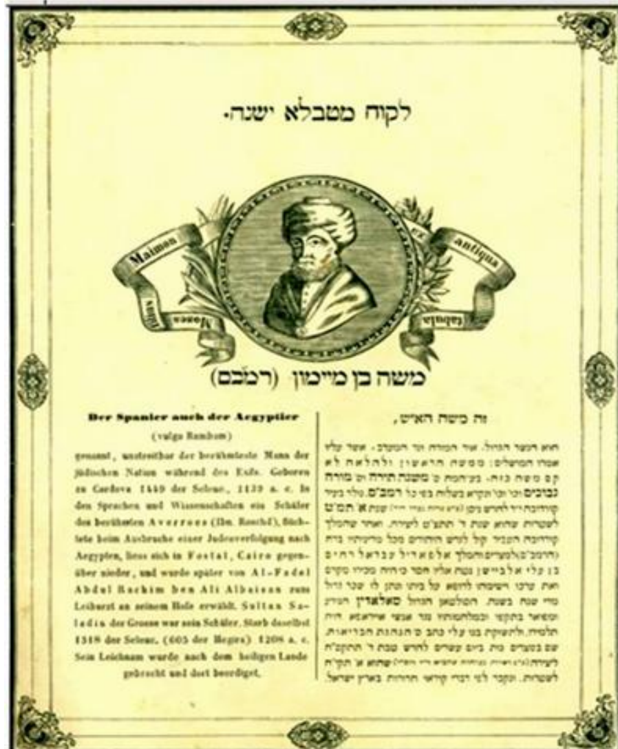
Figure 7. An “authenticity statement” from 1844. Such statements typically accompanied the Maimonides portrait. Note the title in Hebrew that boldly reads “ex-antiqua tabula” and the abbreviated Maimonides biography in both Hebrew and German.

[The following rules apply regarding] a signet ring which bears a human image: If the image is protruding, it is forbidden to wear it, but it is permitted to use it as a seal. If the image is an impression, it is permitted to wear it, but it is forbidden to use it as a seal, because it will create an image which protrudes.