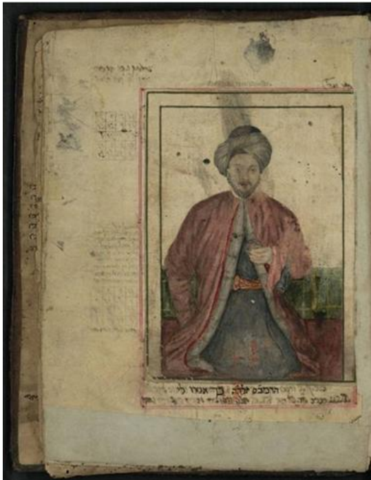
Figure 5. Maimonides portrait. 7 Maimonides appears to be holding Nautilus as a symbol of his broad knowledge of natural sciences.

and apparently played an active role in its dissemination. The portrait was not limited to paper and reprints but was also copied on medallions