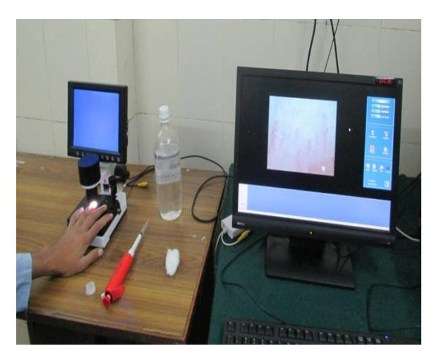
Figure 1. Nailfold Videocapillaroscopy.

The capillary morphology, arrangement, density, length, and width were assessed. The quantitative and qualitative parameters were carefully defined after the literature search.<sup>4,5,12–15</sup> The mean capillary length was calculated as an average of the lengths of the three most clearly visible consecutive capillaries in the fourth finger of both hands. Capillary loop length of >500 \mu m was defined as loop elongation. The width of the arterial and venous limbs was taken in three of the largest appearing capillaries, and finally the mean width was calculated. Capillary with irregularly enlarged diameter of \geq 20 \ \mu m (and <50 µm) was defined as dilated capillary, and homogeneously enlarged capillary with diameter of \geq 50 µm as giant capillary loop. Mean capillary density was calculated as an average of readings (number of capillary loops per linear mm measured in the distal row) in the majority of the eight capillary beds assessed. Presence of avascular areas (areas where two or more consecutive capillaries are absent), microhemorrhages, tortuous, ramified, bushy, branched capillaries, and capillary disorganization (architectural disorientation) were assessed and analyzed. Tortuous or crossing capillaries and dilated capil-