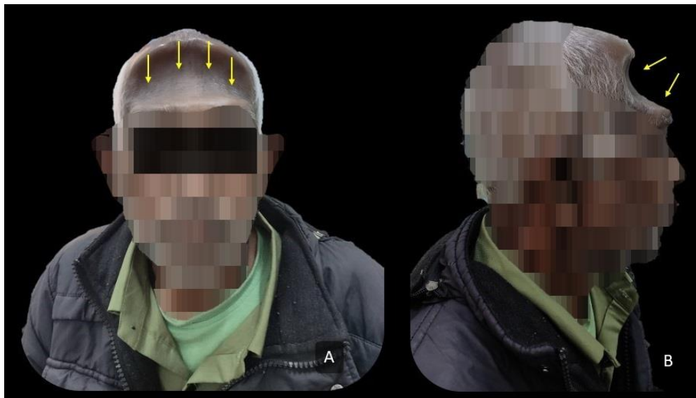
Figure 5. Follow-up Photograph of the Patient Showing Significant Frontal Hollow Due to Extensive Debridement.

A: Debrided frontal bone in axial bony window cuts. B: No abnormal soft tissue density is found in the operative site, suggesting locoregional disease control.