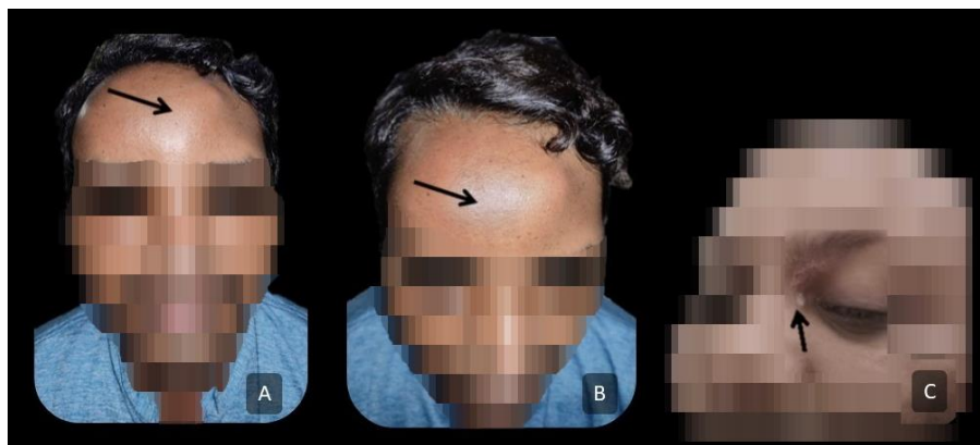
Figure 1. Physical Characteristics of Patients with Frontal Bossing (A and B) and Discharging Sinus (C).

None of the patients experienced neurological deficits following the surgery; 2 patients had local wound collection that required exploration and evacuation under anesthesia (Clavien–Dindo grade 3b). All the patients received prophylactic broad-spectrum antibiotic coverage with ceftriaxone and metronidazole for 7 days, or until culture sensitivity reports were negative, together with antifungal treatment with amphotericin B. The prophylactic antibiotics were given to prevent infection at the surgical site as per the institutional rational antibiotics usage policy; the surgical wounds were Centers for Disease Control and Prevention (CDC) class III contaminated. 8 Amphotericin B was contin-