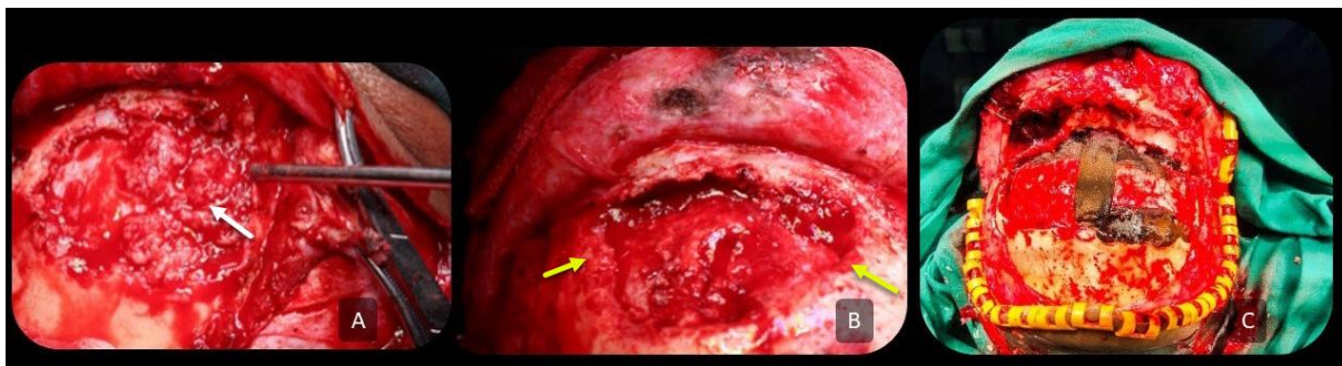
Figure 3. Intraoperative Photographs Depicting the Fungal Debris.

A and B: Axial and sagittal contrast-enhanced CT, respectively, showing complete erosion of frontal bone with necrotic soft tissue debris between the skin and dura; the dura appears enhanced. C: T2-weighted axial MRI cuts depicting heterogeneously enhancing soft tissue density in the frontal sinus with posterior table erosion. D and E: Axial and coronal contrast-enhanced CT cuts, respectively, depicting the erosion of anterior and posterior tables of frontal sinus, suggestive of osteomyelitis.