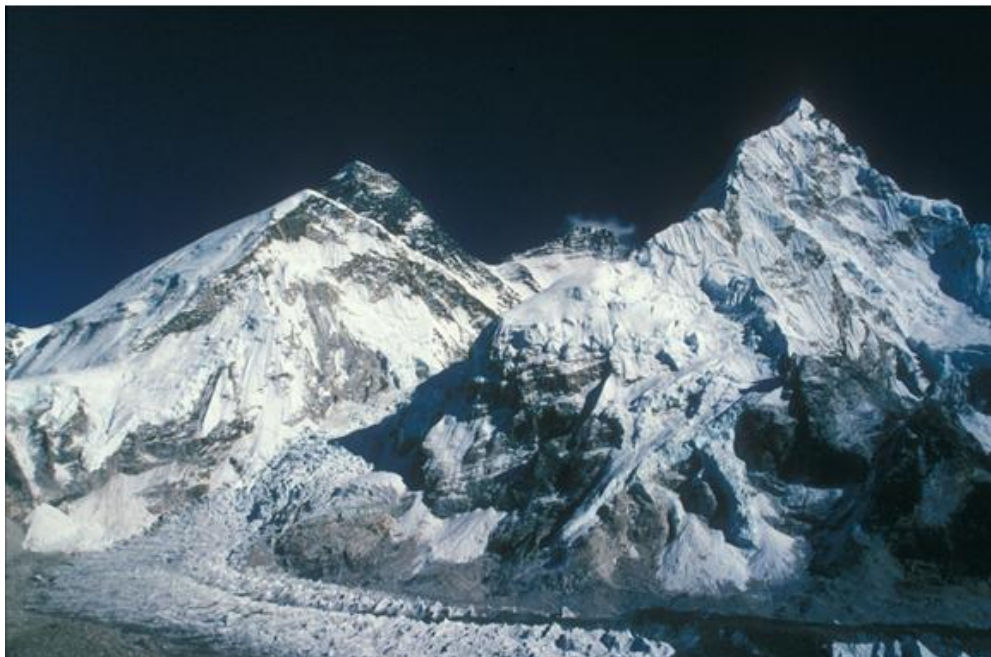
Figure 1. Nuptse on the right, Lhotse in the center, and Mount Everest to the left rear with the Khumbu ice-fall and glacier in the foreground.

physiologic responses to high-altitude hypoxia to provide a context for understanding high-altitude illnesses; the second is to discuss specific risk factors, prevention, and treatment options for acute mountain sickness (AMS) and the potentially fatal syndromes of high altitude pulmonary and cerebral edema so that physicians and health care professionals can appropriately advise travelers ascending to high altitude. The review is organized by specific topics to allow the reader to quickly identify areas of interest.