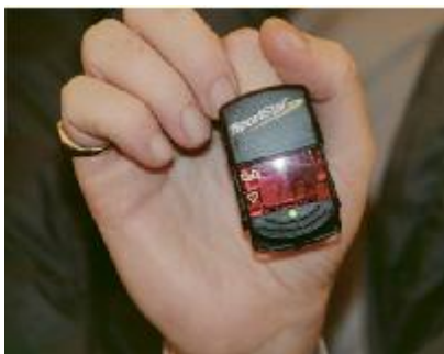
Figure 3. Pulse oximeter.

Pulse oximeters have a pair of small diodes