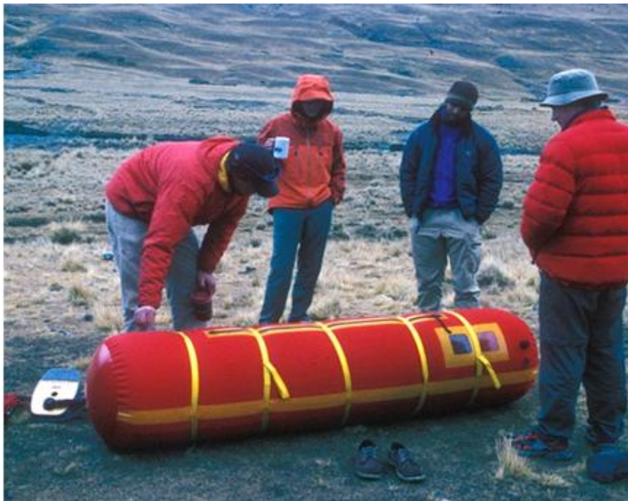
Figure 4. Portable hyperbaric chamber.

The exact processes leading to high-altitude cerebral edema are unknown although the edema is probably extracellular, due to blood–brain barrier leakage (vasogenic edema), rather than intracellular, due to cellular swelling (cytotoxic