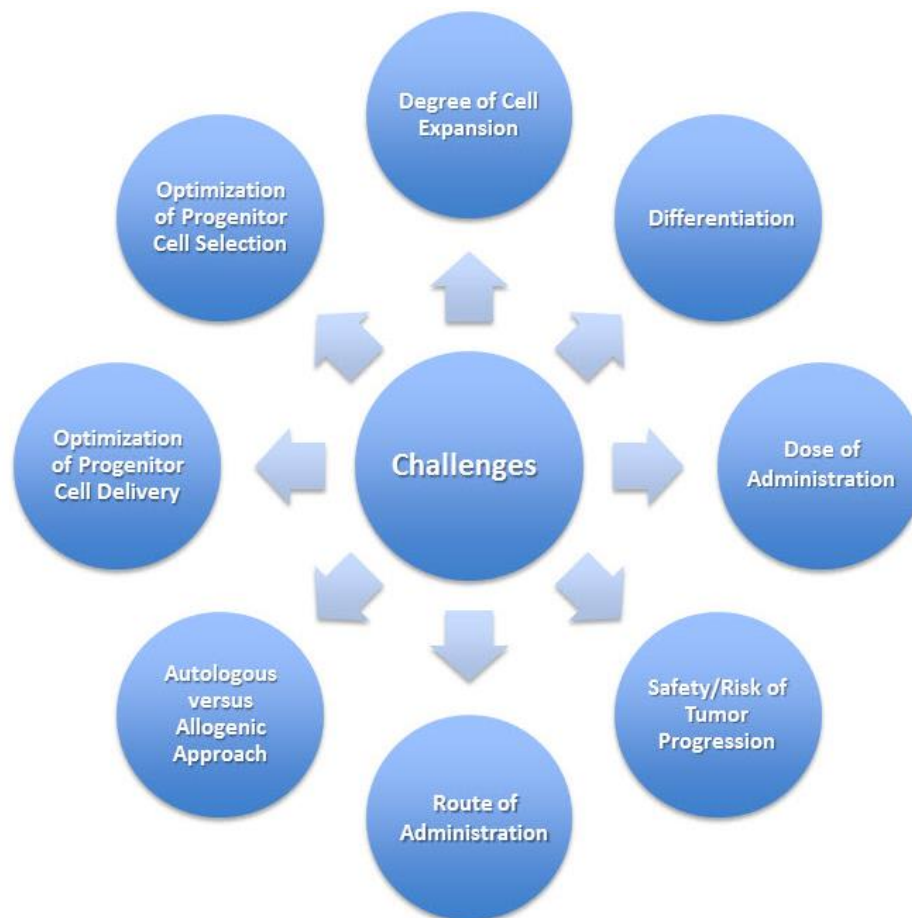
Figure 2. Challenges for the Clinical Application of Stem Cells to Treat Diabetic Vascular Complications.

and modulate inflammation. Furthermore, autologous cell-based approaches are ideal to minimize immune rejection but may be limited by the declining cellular function associated with diabetes. However, significant hurdles remain in optimizing progenitor cell selection and delivery (Figure 2). As our understanding of stem cell biology and heterogeneity grows, improved cell selection should lead to observable benefits. Emerging techniques such as microfluidic single-cell characterization offer particularly attractive strategies for identifying and isolating the most effective cells for therapeutic use. Despite the multiple barriers to clinical implementation, stem cells have shown sufficient promise to garner a place in the field of regenerative medicine. Progenitor cell therapies have significant implications for human health. More clinical studies are needed to build on recent successes in basic and translational research in hopes of revolutionizing diabetes care in the twenty-first century.