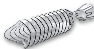
Figure 3. Allium Triangular Prostatic Stent (TPS). The TPS is used for the treatment of prostatic obstruction.

Attached to the main body of the stent—which has a high radial force—is a trans-sphincteric wire, intended to prevent sphincteric dysfunction and decrease the incidence of urinary incontinence. Attached to the wire is the anchor segment, which rests in the urinary bladder and prevents migration.