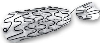
Figure 4. Allium Round Posterior Stent (RPS). The RPS is used for treatment of bladder neck contracture.

The Allium Round Posterior Stent (RPS) (Figure 4) is designed for the treatment of bladder neck or posterior urethral contracture, mainly following prostatic surgery (radical prostatectomy, open prostatectomy, and endoscopic prostatectomy).