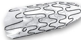
Figure 1. Allium Bulbar Urethral Stent (BUS).

The stent comes mounted on a 22 Fr specially designed delivery tool; after delivery the stent expands to 45 Fr caliber. The BUS comes in three different lengths: 50 mm, 60 mm, and 80 mm. Moreover, there is an 80-mm reverse-mounted stent designed