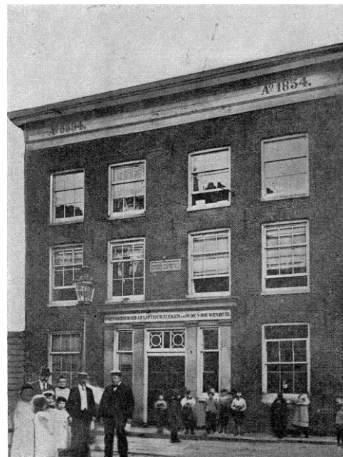
Figure 4. Picture of the First Portuguese Jewish Hospital and Old Age Home for Women Which Was Established in 1834. 19(p23)

The appointments of the physicians, surgeons, and apothecaries (with preference given to com-