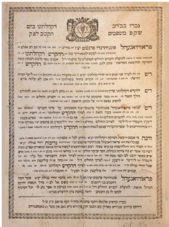
Figure 1. The Synagogue Announcement Requesting Financial Support to Build the First Jewish (Ashkenazi) Hospital in Amsterdam. 9 (entry 714, no. 21) See Appendix.

The top floors of the 1833 building were designated for use by the aged, and the lower floors housed the female patients; male patients and the mentally deranged were placed in an outbuilding in the backyard of the tavern. Sixty patients and 11 demented individuals could thus be treated. In 1834, an adjacent house was purchased which served to provide food for outpatients (provided by the Bikur Holim(A) society) and also to admit patients for whom there was no room in the main hospital. It soon became obvious that the whole facility was too small to meet the needs of the indigent Jewish sick.